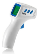
Digital thermometer for temperature check. Each employee will have its temperature tested before accessing the work station