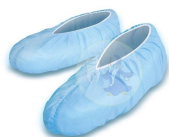
Disposable shoe covers