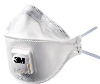
Face mask FFP2 or FFP3