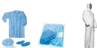
Disposable lab coat